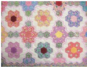
Drift Creek Camp Lincoln City, Oregon

Doors open and registration begins at 4:00 p.m. Please be patient with us while we get you assigned to a room!