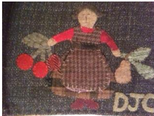
Sample of wool work... not class project!

Bring to class: paper scissors, fabric scissors, and chocolate!